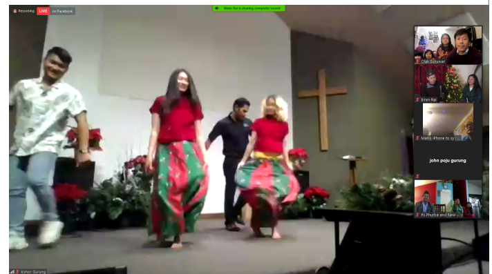
Minnesota Nepali Church performing Christmas Dance