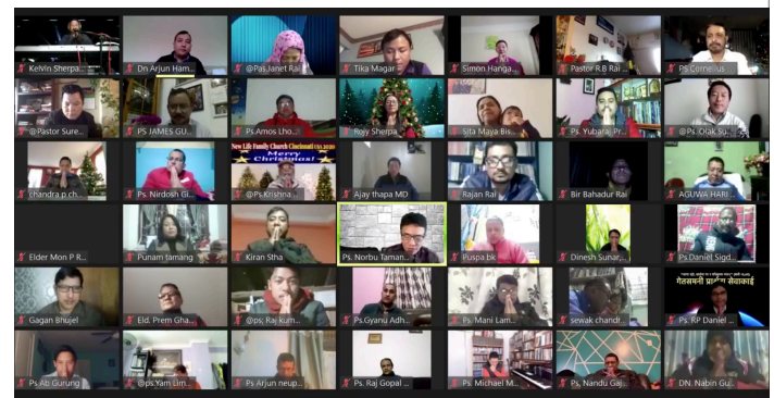
International Nepali-speaking Leadership Training