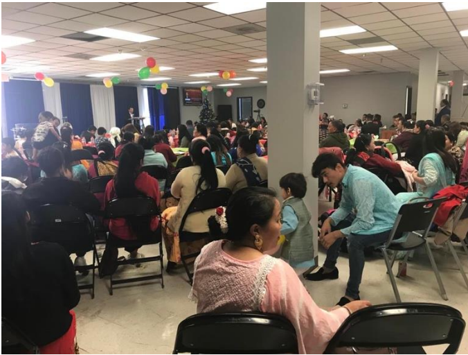
Christmas celebration at Grace Nepali Church, Omaha, NB