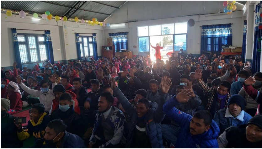
Christmas celebration service at Newly constructed church building, Nepal.