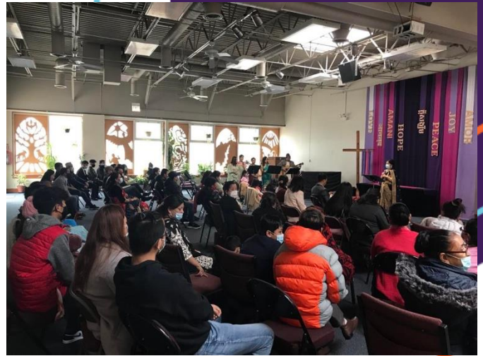
Christmas celebration at Living Water Community Church, Chicago, IL