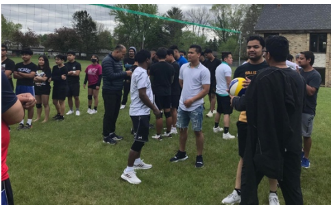
Midwest Churches volleyball tournament