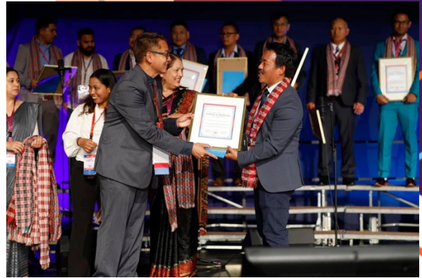
Bhutanese-Nepali Churches of America summit 2022 at Harrisburg, PA.