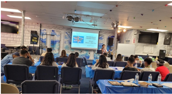
Teaching at Akron, Ohio