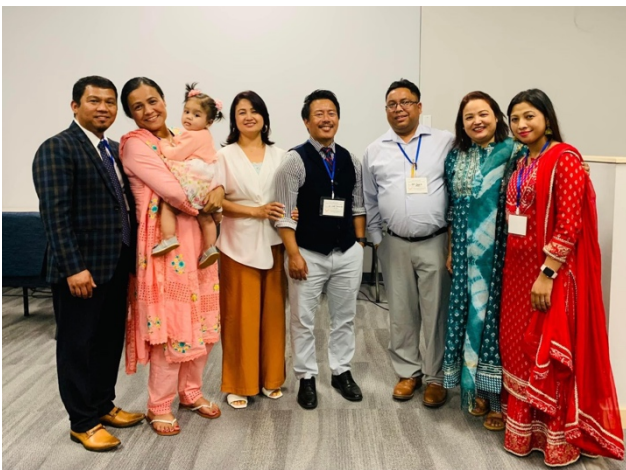
With pastors' family at Mission Conference at Minnesota

Midwest Unity Network of Nepali-speaking churches organized a mission seminar in Minneapolis MN on June 17-18. This seminar was centered on how the Nepali-speaking churches can work with other American churches to build relationship and broaden a vision for Christ's calling beyond our own culture. We invited Nepali pastors and local American pastors who share their church buildings and resources with Nepali-speaking churches to discuss their experiences of working with each other, how their relationship and valuing each other's culture helped them to partner in the ministry.