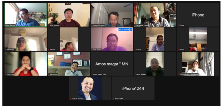
Midwest Bible Study