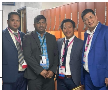
Excited to meet in person! I have been meeting and teaching them virtually.

If you have any questions regarding the ministry or would like to contact me, please use the given contact information below. Thank you!