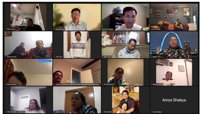
Midwest Bible Study