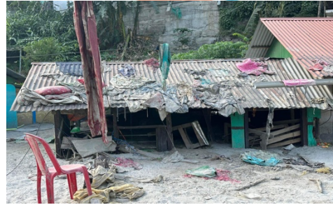
Flood relief supported by Midwest Nepali Churches